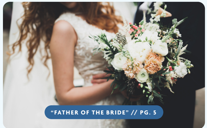
"FATHER OF THE BRIDE" // PG. 5