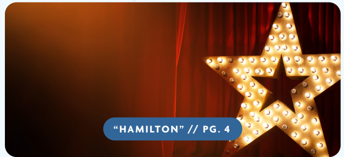
"HAMILTON" // PG. 4